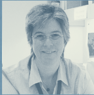
Randy Roberts Crocker Art Museum

"All of us got to where we are because we value audience research and the feedback loop we have with our families. When it comes to best practices, I think about the number of resources we've put into evaluating our programs and developing our staff ... and that we'll continue to do."