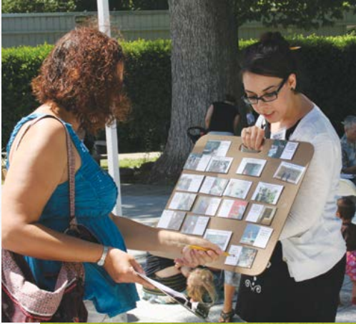
Family Friday Audience Evaluation, Crocker Art Museum