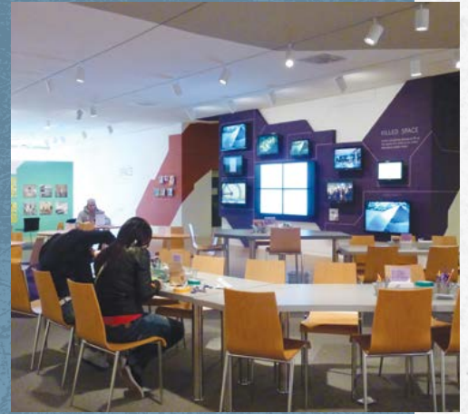
Center for Creative Connections, Dallas Museum of Art