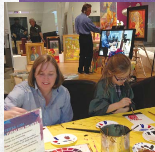
Painting Studio, Denver Art Museum