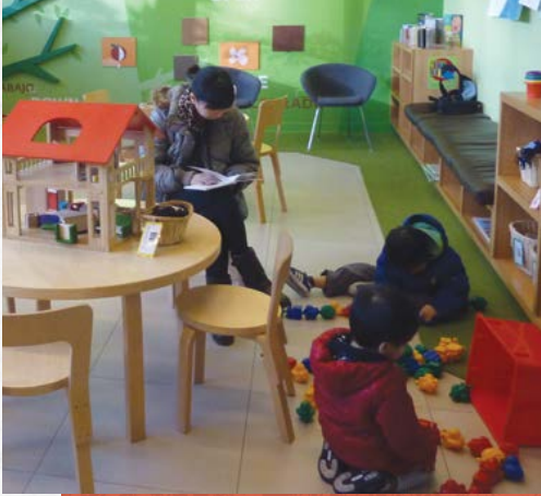
Arturo's Nest, Dallas Museum of Art