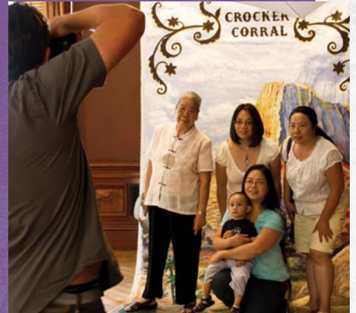
Four generations at the Crocker Art Museum