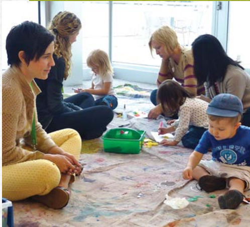
Create Playdates, Denver Art Museum