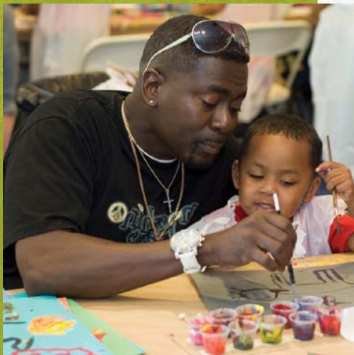
Family Festival, Crocker Art Museum

To keep pace with emerging trends and better serve family audiences we will: address parents' needs and desires.