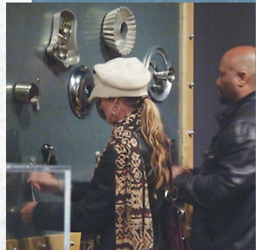
Center for Creativity, Columbus Museum of Art