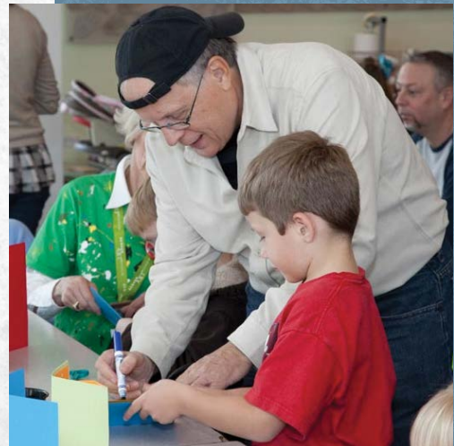
Family Free Day, Crocker Art Museum