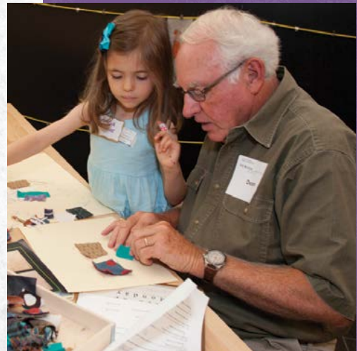
Family Visitor Panel, Denver Art Museum