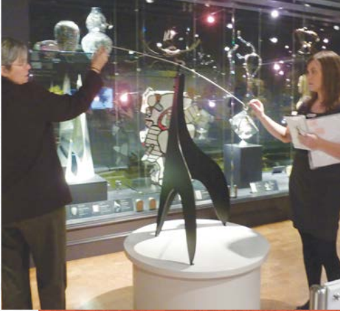
Wonder Room, Columbus Museum of Art