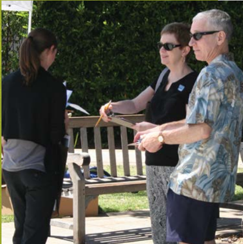
Family Friday Audience Evaluation, Crocker Art Museum

To keep pace with emerging trends and better serve family audiences we will: incorporate audience evaluation in our decision-making process.