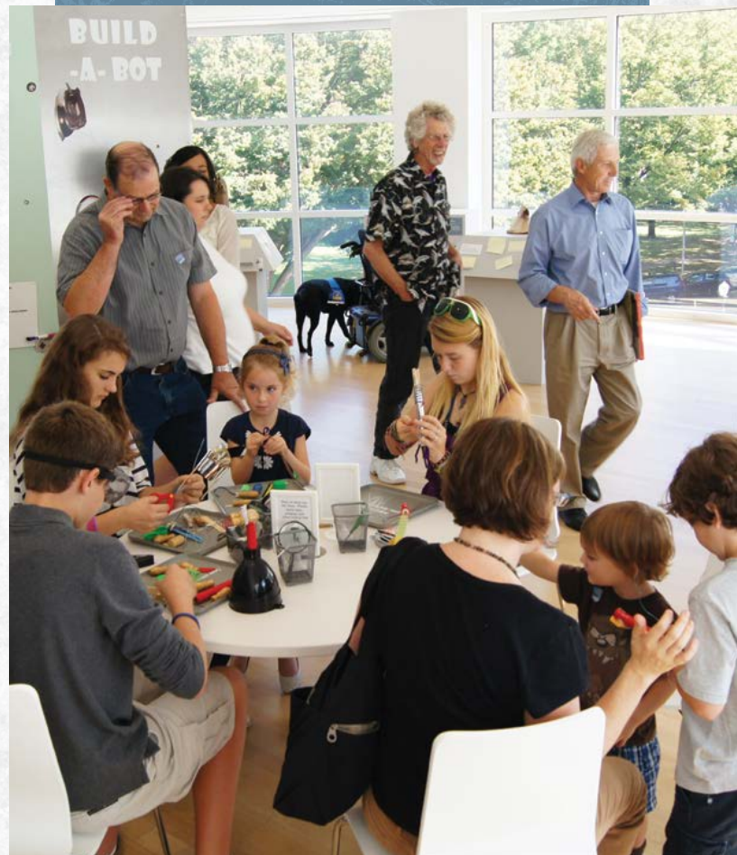
Member Morning, Crocker Art Museum