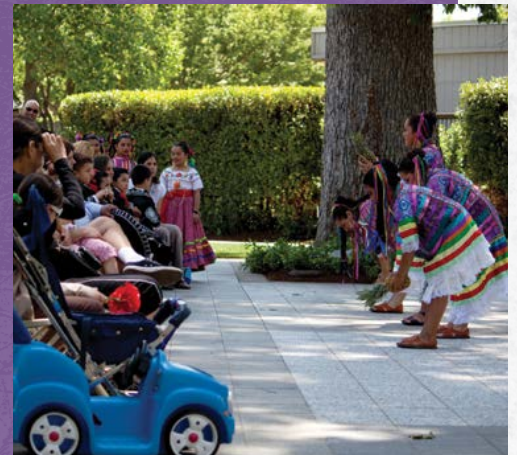
Family Festival, Crocker Art Museum