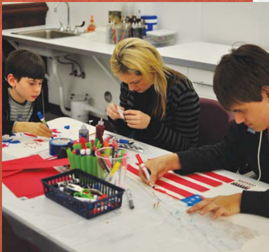
Presidents' Day Art Making, Crocker Art Museum

To keep pace with emerging trends and better serve family audiences we will: provide engaging experiences for all ages.