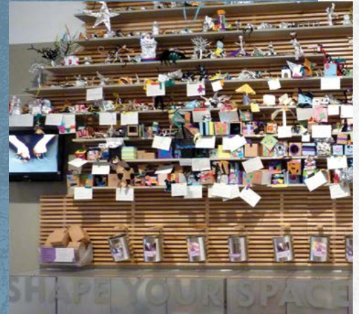
Center for Creative Connections, Dallas Museum of Art