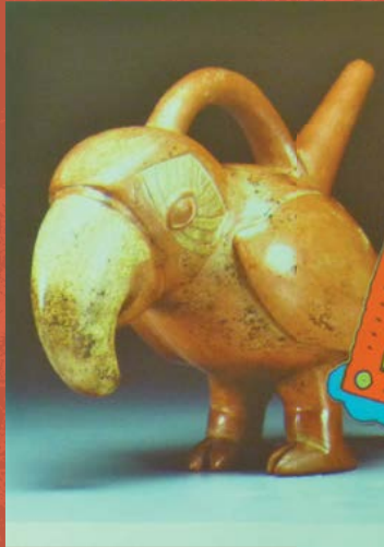
Arturo, Dallas Museum of Art